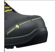
HAIX® Nano-Carbon Toe Cap