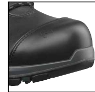
HAIX® Composite toe cap