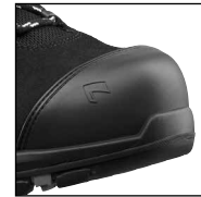
HAIX® Composite Toe Cap