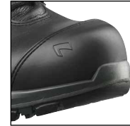
HAIX® Composite Toe Cap